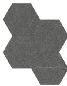
6" Hexagon Mosaic