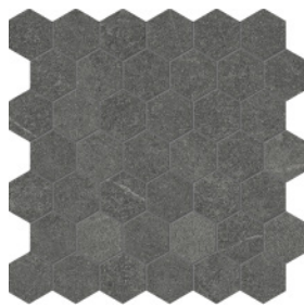
2" Hexagon Mosaic