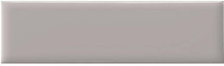
Grey 3x10 in Pressed - Glossy/Matte