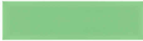
Spring Green 3x10 in Pressed - Glossy/Matte