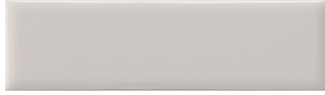
Beige 3x10 in Pressed - Glossy/Matte