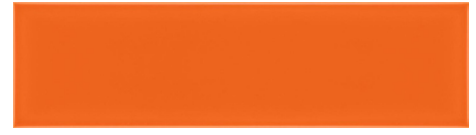
Orange 3x10 in Pressed - Glossy/Matte