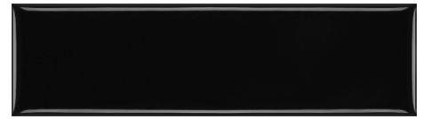
Black 3x10 in Pressed - Glossy/Matte