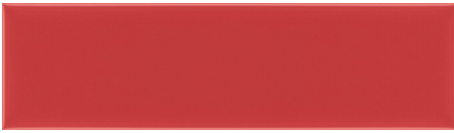
Red 3x10 in Pressed - Glossy/Matte