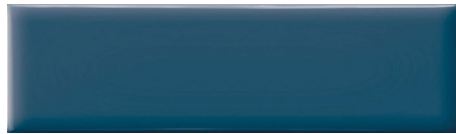
Admiral 3x10 in Pressed - Glossy/Matte