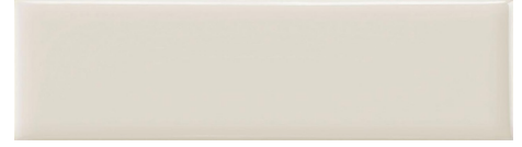
Taupe 3x10 in Pressed - Glossy/Matte