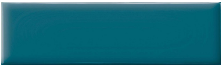
Teal 3x10 in Pressed - Glossy/Matte