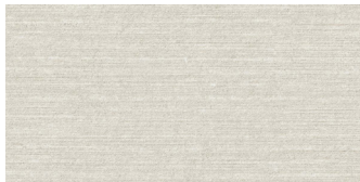
White 3D Linear Deco