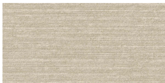
Beige 3D Linear Deco