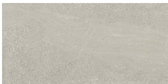
Light Gray Natural