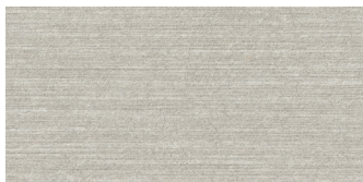
Light Gray 3D Linear Deco