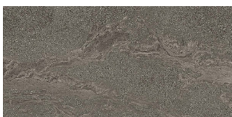
Dark Gray Natural