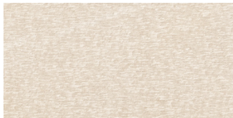
Sabbia 3D Chiseled Deco