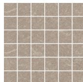
12"x12" Tortora Mosaic