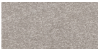
Tortora 3D Chiseled Deco