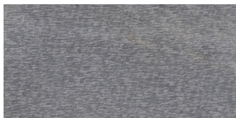
Grigio 3D Chiseled Deco