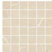
12"x12" Sabbia Mosaic